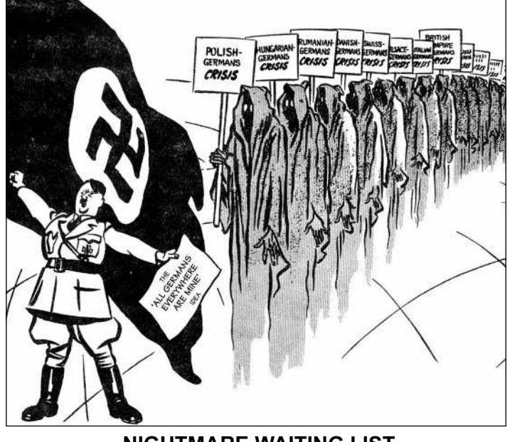
NIGHTMARE WAITING LIST