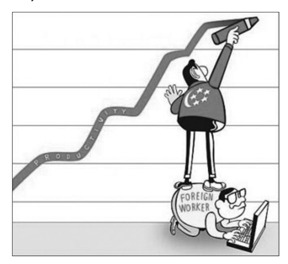
Source A: A local cartoonist's view on Singapore's foreign manpower policy, The Straits Times, 10 February 2015.

Over the years, Singaporeans have had mixed feelings about the government's policy of employing foreign manpower. Study the following sources to assess how far Singaporeans have welcomed foreign manpower into the country.